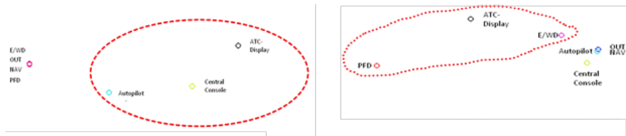
Figure 1. Left-hand: After the traffic warning, information sources relevant for collision avoidance are focused (red circle). Right-hand: The pilot notices the engine failure occurring directly after the traffic warning late; however still also focuses on ATC-display (irregular red shape) [Note: the NMDS representation is dimensionless]